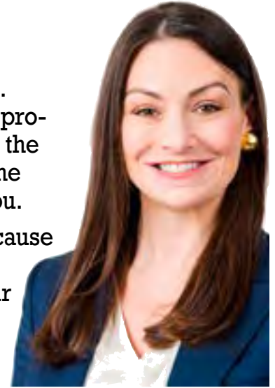
Nikki Fried Chair, FDP