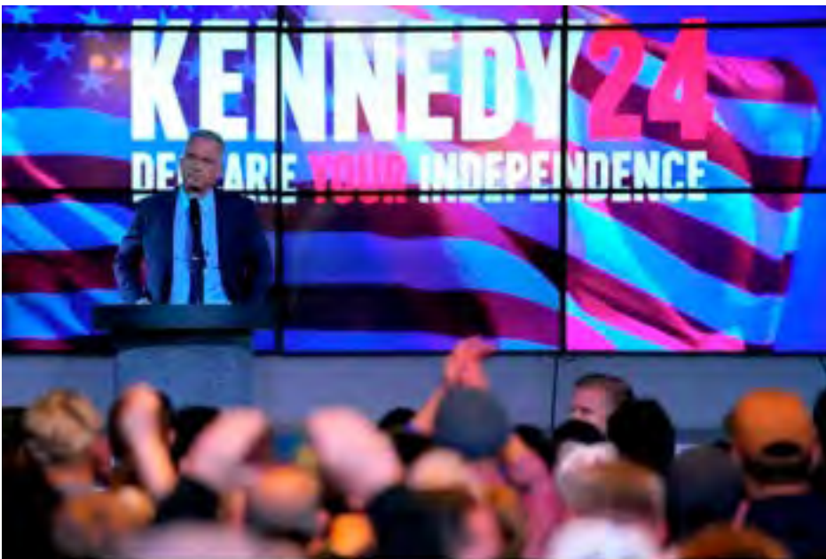
Independent presidential candidate Robert F. Kennedy Jr. speaks at a voter rally, Wednesday, Dec. 20, 2023, in Phoenix.

A s pundits and politicians spar over whether Robert F. Kennedy Jr.'s presidential campaign will factor into the outcome of the 2024 election, one thing is clear: Kennedy's political following is built on a movement that seeks to legitimize conspiracy theories.