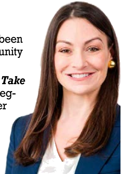
Nikki Fried Chair, FDP